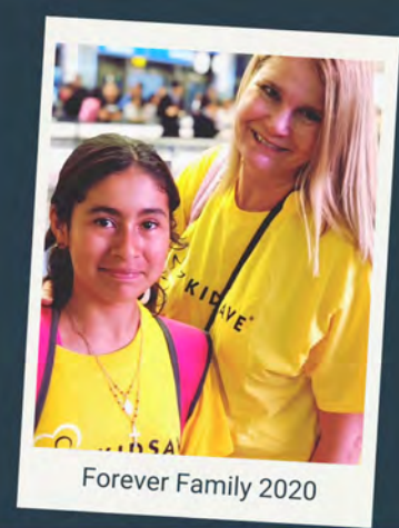
Mafe found her forever family this year.